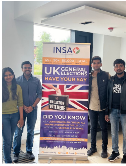
University of Warwick