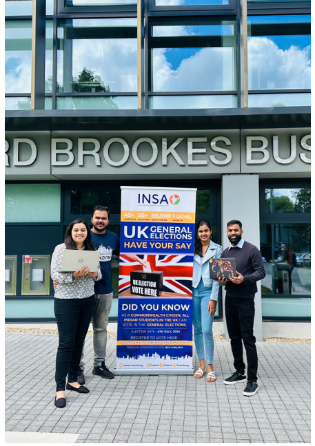
Oxford Brooks University