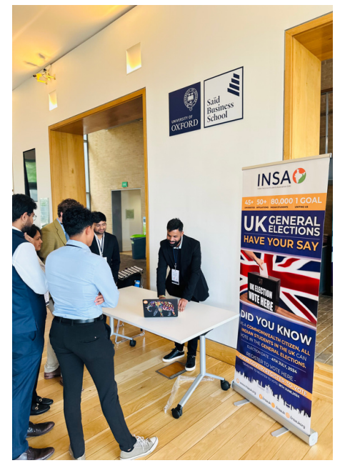
University of Oxford

In anticipation of the UK's General Elections , INSA launched an impactful campaign urging eligible Indian students to register to vote. The initiative not only educated students about their rights but also underscored their influence in shaping the political discourse in their host country.