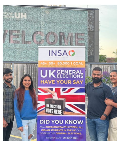
University of Hertfordshire