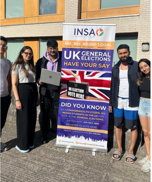
University of Manchester